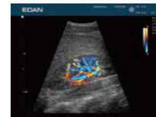
Color Doppler Sensitivity Kidney