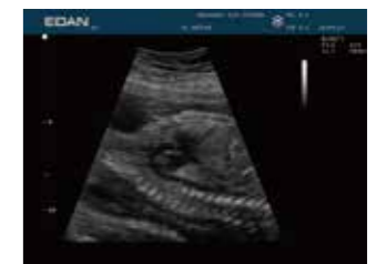
Speckle Reduction Imaging 25-week OB