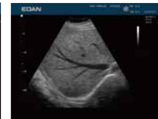
Superior Penetration Body Mass Index of 60