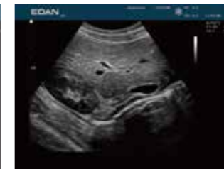
Harmonic Imaging Liver, Kidney