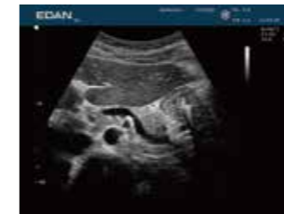
Excellent Contrast Resolution Liver, Pancreas

The U2 offers a wide range of advanced clinical applications to address all of your imaging needs. Practical clinical tools and calculations packages improve information access for clinical utility.