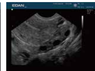
Endovaginal Imaging Uterus and Ovary