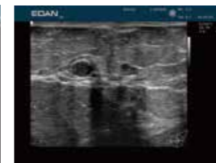
High Frequency Imaging Complex Breast Cysts